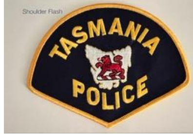
Tasmania Police Shoulder Flash

One of the most rewarding benefits of participation in the LGBTQ+ forum in my personal view, is the ability to reach out to LGBTQ+ law enforcement organizations and personnel in cities throughout the USA, and in countries around the world. By reaching out and connecting, we are able to share information, exchange ideas, offer support, glean initiatives and concepts that can be deployed in San Francisco, and we build a network of friendships when we visit their cities and countries as well as extending friendship when they visit our own San Francisco.