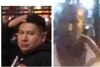
Possible suspects involved in "Shoulder Surfing"

We have noticed a number of suspicious people hanging around the Bank of America and CitiBank ATM's over the last few months whom we suspect may be "shoulder surfing."